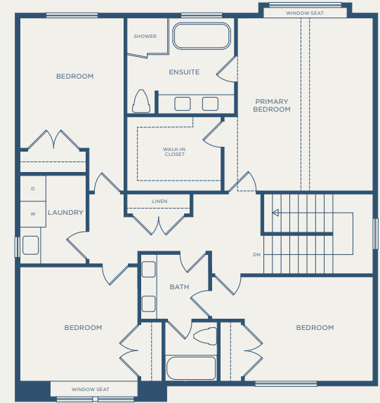
UPPER 1,186 SQFT

The developer reserves the right to make modifications and changes to the building design, elevations, dimensions, specifications, features and prices without prior notification. Decks, patios, stairs and windows may vary based on site conditions. All sizes and dimensions are approximate and based on architectural measurements. Reverse and/or mirror plans occur throughout the development. E & OE.