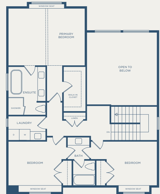
UPPER 990 SQFT

The developer reserves the right to make modifications and changes to the building design, elevations, dimensions, specifications, features and prices without prior notification. Decks, patios, stairs and windows may vary based on site conditions. All sizes and dimensions are approximate and based on architectural measurements. Reverse and/or mirror plans occur throughout the development. E & OE.